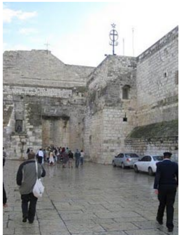
Church of the Nativity Bethlehem